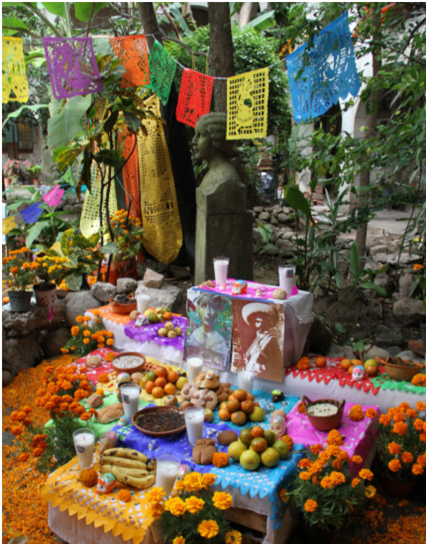
Day of the Dead altar with perforated paper banner, marigolds, referred to as flowers of the dead , and a large variety of offerings

Recent travel to Mexico to observe regional differences in the celebration of Day of the Dead ( Día de Muertos in Spanish, without the American inclusion of “los”), leads me to continue my ruminations about the clash of tradition with societal changes and the ongoing efforts needed to both preserve and adapt traditions to insure their continuation for generations to come.