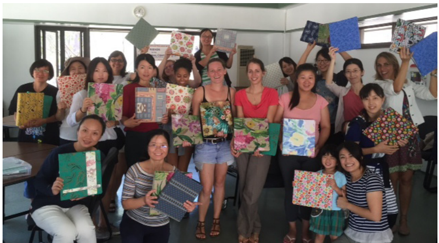
Wednesday Coffee participants hold up the binders they covered with colorful fabric