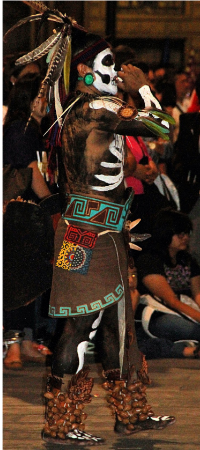
Masked Spirit Dancer: Present-day indigenous tribes have retained portions of their ancient rituals, such as prayers, clothing, dances, and food.

While I remain enchanted by the aging craftsmen who still pound up to thirty sheets of tissue paper by hand to make their traditional patterns, I recognize that the papel is as ephemeral as the occasion; as a pragmatist, I am also drawn to the mass-produced intricate designs created in mylar that solve many logistical challenges and allow for longer enjoyment of the colorful designs. That both can co-exist for now is lovely, but I know the time will come when the true craftsman will be a