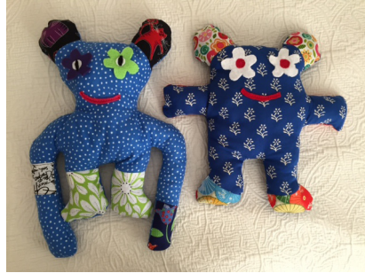
Two of the many stuffed toys Lynn has made

My contribution to the Craft Circle is more about teaching participants how to knit or crochet, so they can learn to make anything they want. They are so creative! Because I also love sewing, I show participants how to use a sewing machine, how to use a pattern, how to mend clothes, etc. It was so satisfying to see the participants from the Craft Circle make such beautiful gifts at a recent baby shower!